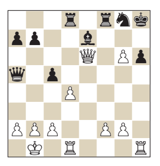
22.還xh6+! The real point. 22...公xh6 23.豐xe7 公f7 The only move.