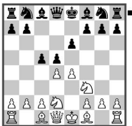
Position after: 4. \text{N}gf3

This line is a clever way for White to postpone his decision. It avoids the 5...a6 line in the IQP variations. 4... \text{N}f6 [4... \text{N}c6 5. exd5 exd5 transposes to the main line.] 5. e5 \text{N}fd7 6. c3